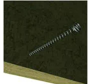
Fire spring PAROC XFS 001